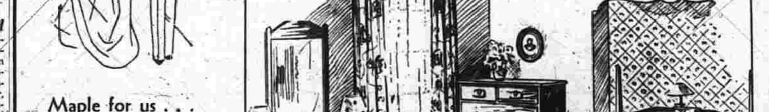
Cushman Early American Exclusive scuffed and highlighted finish

Excellent Colonial styling plus rugged solid maple construction makes Plymouth House Maple an outstanding value. 3 pieces shown, selected from Open Stock, $89.50.