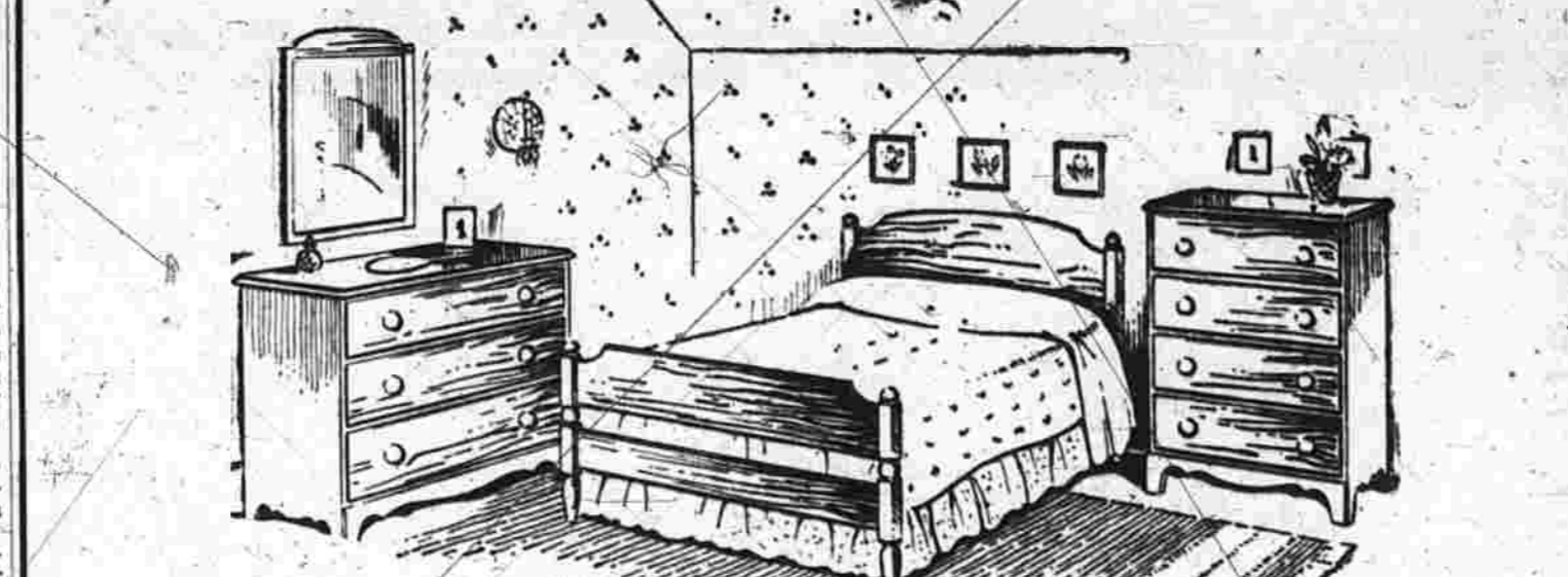
Plymouth House Maple Quaint as can be yet inexpensive

(Continued from Page One) Japanese ground troops near while, the British forces killed 23 of the foe and took two prisoners. Bombers, Hurricanes, and Mohawks, on offensive patrols over enemy positions along the coastal area of Burma from the Mays river to Sandoway, destroyed at least 12 Japanese planes and damaged many others, the bulletin said. Large Fires Left Burning Bombing bombers escorted by fighters blasted enemy supply concentrations east of Taunggyi during the day. A Japanese Taunggyi itself last night leaving several large fires burning both sides. In the Buthidaung area 15 enemy motor vehicles were either destroyed or badly damaged in an attack from the rear. Warehouses were hit by bombs near Satoyoga creek near Kanchung. A British patrol surprised a party of 42 Japanese in a rice paddy in the Taung Bazar area, killing 15, taking two prisoners and forcing the remainder of whom at least five were wounded, to flee. The other skirmish occurred in northern Burma near Suprabham where a Kachin patrol and detachment of 30 Japanese. Eight of the enemy were killed and the remainder suffered no loss.